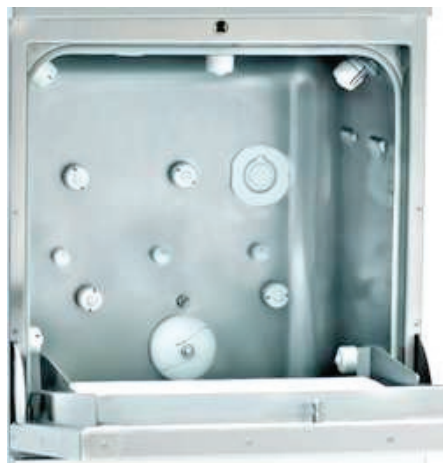
Chamber - Detailed View