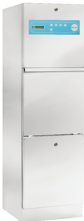
Dim. (WxDxH mm): 450x500x1500

Small basket allows the washing and disinfection of instruments.